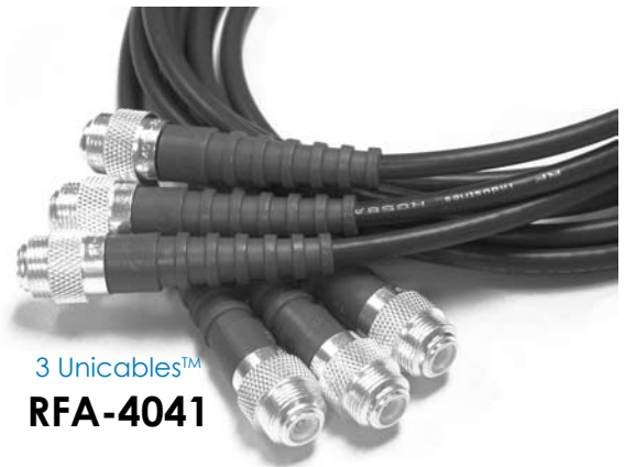
3 Unicable™ RFA-4041