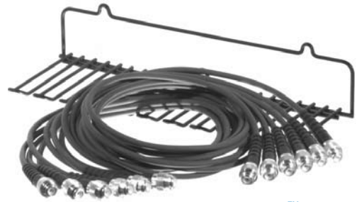
6 piece Unicable™ Kit with rack RFA-4040