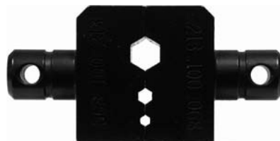
RFA-4009-06 HEX CAVITIES: .068", .100", .213"