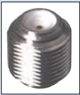
Universal Center Adapter

Each Unidapt™ fitting has a common connector end and a universal adapter end. Simply choose the two common connector ends you need, and screw them together with the universal adapter. It's so easy. That's why technicians love it! Our ingenious adapter kits let you mix and match any 2 male or female coaxial fittings. Build the perfect adapter or cable assembly for the job — Male-to-Male, Male-to-Female, or Female-to-Female.