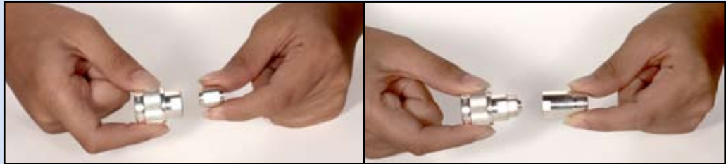
Universal adapter mates with all Unidapt™ interface adapters. Other side of universal adapter then mates with any other Unidapt™ interface adapter.