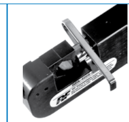
Lower die removal