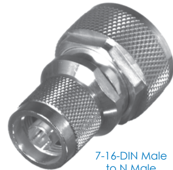
7-16-DIN Male to N Male RFD-1670-2