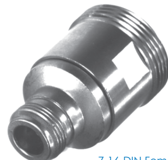
7-16-DIN Female to N Female RFD-1673-2