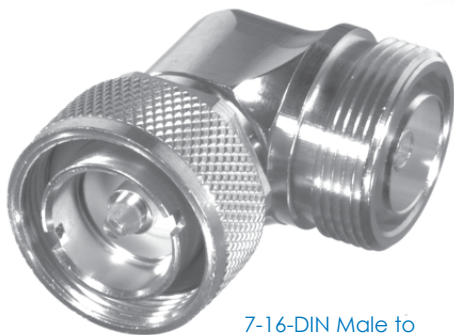
7-16-DIN Male to 7-16 DIN Female (RA) RFD-1652-2

INDIVIDUAL ADAPTERS ARE SHOWN AT ACTUAL SIZE. PHOTOS ARE GRAYSCALE.