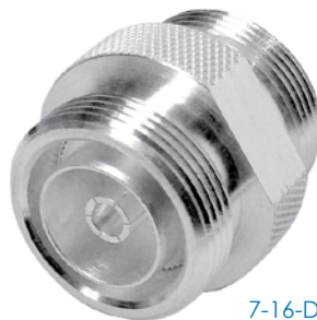
7-16-DIN Female to 7-16 DIN Female RFD-1653-2