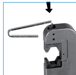
Upper die removal