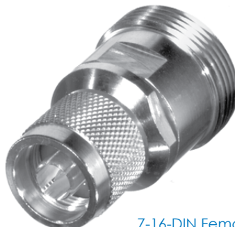
7-16-DIN Female to N Male RFD-1672-2