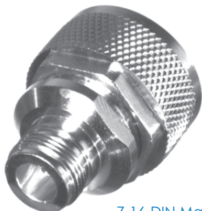
7-16-DIN Male to N Female RFD-1671-2