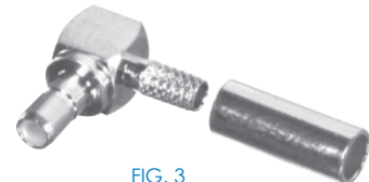
FIG. 3 RSB-750-1B, -1B1

PHOTOS FOR REFERENCE ONLY, SHOWN AT 150% ACTUAL SIZE.