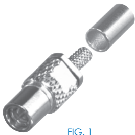
FIG. 1 RSB-700-179-1