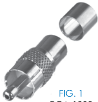
FIG. 1 RCA-1902