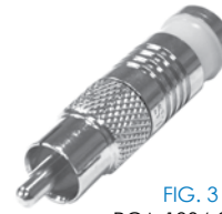
FIG. 3 RCA-1904-01-D, -02-D, -03-D