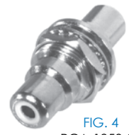
FIG. 4 RCA-1950-03

PHOTOS FOR REFERENCE ONLY, SHOWN AT 100% ACTUAL SIZE.