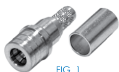
FIG. 1 RQA-5000-C, -C1, -X