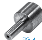
FIG. 4 QMA -TOOL

PHOTOS FOR REFERENCE ONLY, SHOWN AT 100% ACTUAL SIZE.