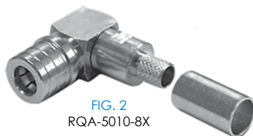
FIG. 2 RQA-5010-8X