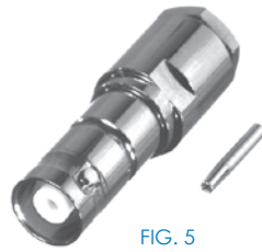
FIG. 5 RHV-124-D