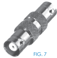
FIG. 7 RHV-134

PHOTOS FOR REFERENCE ONLY, SHOWN AT 100% ACTUAL SIZE.