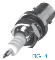
FIG. 4 RHV-116