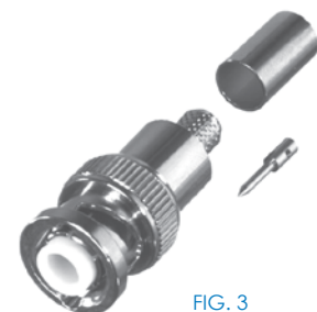
FIG. 3 RHV-106-D