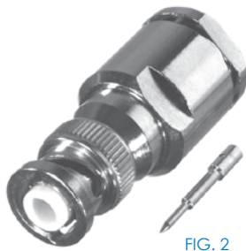
FIG. 2 RHV-100-E, -X