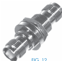
FIG. 12 RT-1226