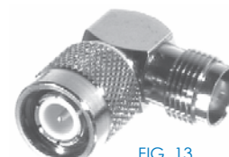
FIG. 13 RT-1227

PHOTOS FOR REFERENCE ONLY, SHOWN AT 100% ACTUAL SIZE.