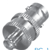
FIG. 11 RT-1142