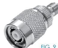
FIG. 9 RP-3472