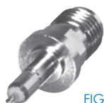
FIG. 10 RSE-6701 (shown at 150% size)