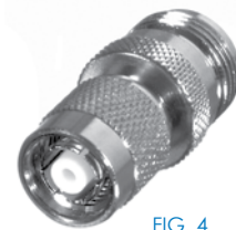
FIG. 4 RP-1234