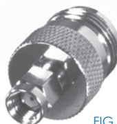
FIG. 7 RP-3452