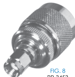
FIG. 8 RP-3453