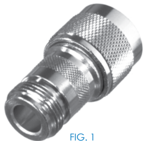
FIG. 1 RP-1015

BODY: G - GOLD N - NICKEL PIN/CONTACT: G - GOLD DIELECTRIC: T - TEFLON