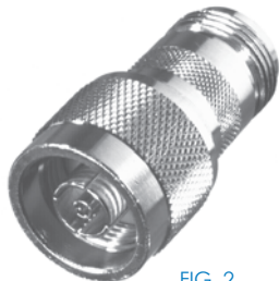
FIG. 2 RP-1016