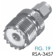
FIG. 19 RSA-3457