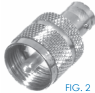
FIG. 2 RFB-1137