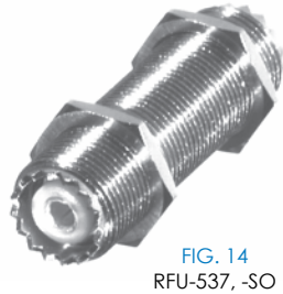
FIG. 14 RFU-537, -SO