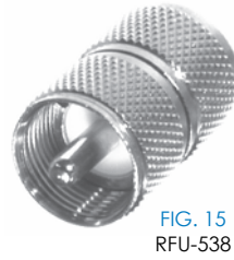
FIG. 15 RFU-538