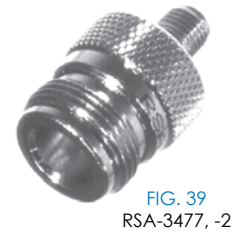
FIG. 39 RSA-3477, -2