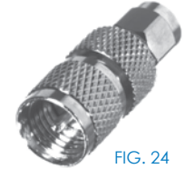
FIG. 24 RSA-3451