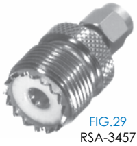
FIG. 29 RSA-3457