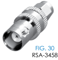
FIG. 30 RSA-3458