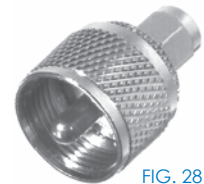
FIG. 28 RSA-3456

PHOTOS FOR REFERENCE ONLY, SHOWN AT 100% ACTUAL SIZE.