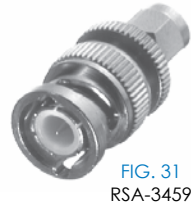
FIG. 31 RSA-3459