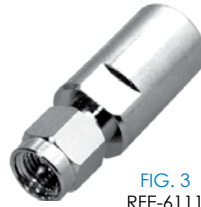
FIG. 3 RFE-6111