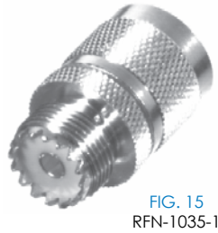
FIG. 15 RFN-1035-1