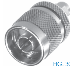
FIG. 30 RSA-3453