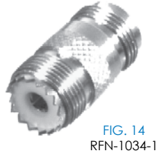
FIG. 14 RFN-1034-1