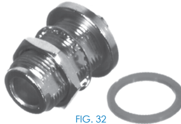
FIG. 32 RSA-3477-03