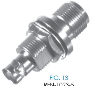
FIG. 13 RFN-1023-5