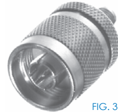
FIG. 33 RSA-3478

PHOTOS FOR REFERENCE ONLY, SHOWN AT 100% ACTUAL SIZE UNLESS OTHERWISE INDICATED.