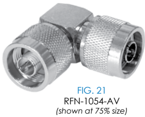
FIG. 21 RFN-1054-AV (shown at 75% size)