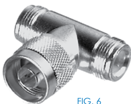
FIG. 6 RFN-1010-1 (shown at 75% size)