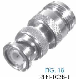
FIG. 18 RFN-1038-1