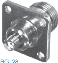
FIG. 28 RSA-3290, -10