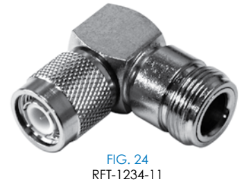
FIG. 24 RFT-1234-11

PHOTOS FOR REFERENCE ONLY, SHOWN AT 100% ACTUAL SIZE UNLESS OTHERWISE INDICATED.