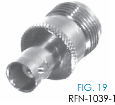
FIG. 19 RFN-1039-1