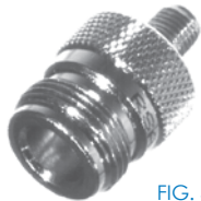
FIG. 31 RSA-3477, -2