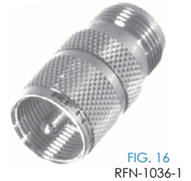
FIG. 16 RFN-1036-1