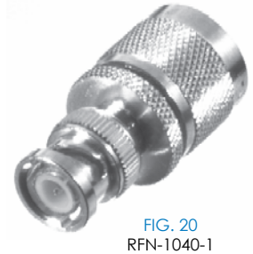
FIG. 20 RFN-1040-1