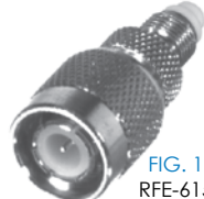
FIG. 17 RFE-6155