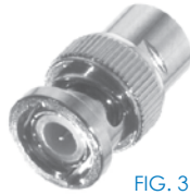
FIG. 3 RFE-6102