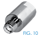
FIG. 10 RFE-6110