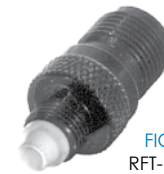
FIG. 19 RFT-1240-1

PHOTOS FOR REFERENCE ONLY, SHOWN AT 100% ACTUAL SIZE.