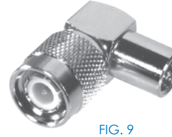
FIG. 9 RFE-6109