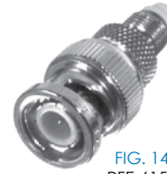
FIG. 14 RFE-6151