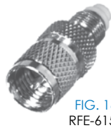
FIG. 16 RFE-6153