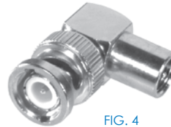
FIG. 4 RFE-6103