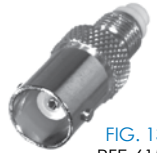
FIG. 13 RFE-6150