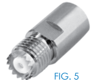
FIG. 5 RFE-6104