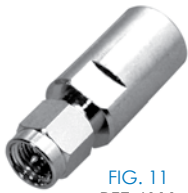
FIG. 11 RFE-6111