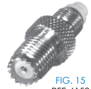
FIG. 15 RFE-6152