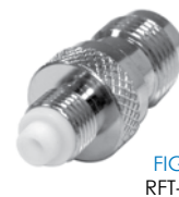
FIG. 18 RFT-1240