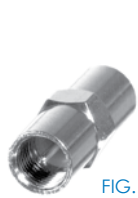
FIG. 1 RFE-6100

BODY: C - BLACK CHROME N - NICKEL PIN/CONTACT: G - GOLD DIELECTRIC: D - DELRIN T - TEFLON