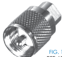
FIG. 12 RFE-6112