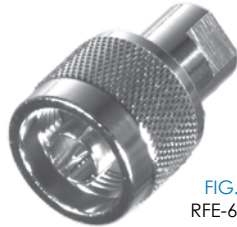
FIG. 7 RFE-6107