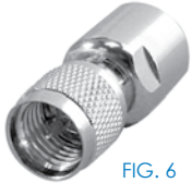
FIG. 6 RFE-6105