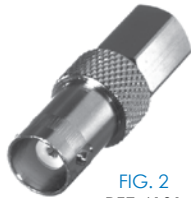
FIG. 2 RFE-6101