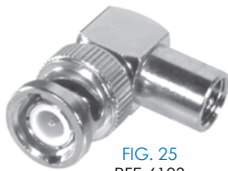
FIG. 25 RFE-6103