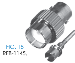
FIG. 18 RFB-1145,