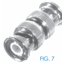
FIG. 7 RFB-1133