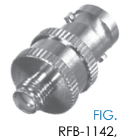
FIG. 16 RFB-1142, -4, -5, -6