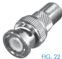
FIG. 22 RFB-1155