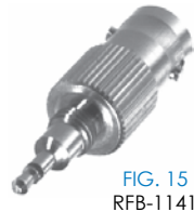
FIG. 15 RFB-1141