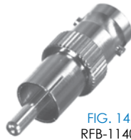
FIG. 14 RFB-1140