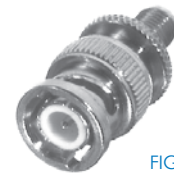
FIG. 44 RSA-3476, -1

PHOTOS FOR REFERENCE ONLY, SHOWN AT 100% ACTUAL SIZE.