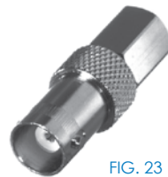
FIG. 23 RFE-6101