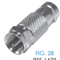
FIG. 28 RFF-1479

PHOTOS FOR REFERENCE ONLY, SHOWN AT 100% ACTUAL SIZE.