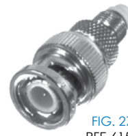
FIG. 27 RFE-6151