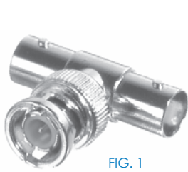
FIG. 1 RFB-1130, -1

BODY: G - GOLD N - NICKEL S - SILVER PIN/CONTACT: G - GOLD N - NICKEL S - SILVER T - TIN DIELECTRIC: D - DELRIN PE - POLYETHYLENE T - TEFLON