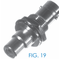
FIG. 19 RFB-1151