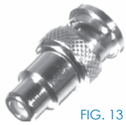
FIG. 13 RFB-1139