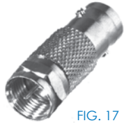
FIG. 17 RFB-1144