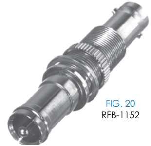
FIG. 20 RFB-1152