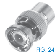
FIG. 24 RFE-6102