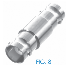
FIG. 8 RFB-1134