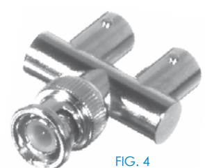
FIG. 4 RFB-1130-5