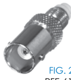
FIG. 26 RFE-6150