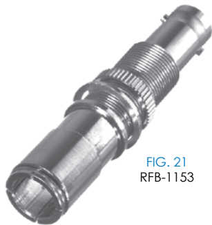
FIG. 21 RFB-1153