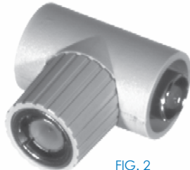
FIG. 2 RFB-1130-2