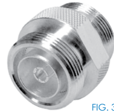
FIG. 3 RFD-1653-2