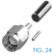
FIG. 24 RP-3000-1B, -1B1, -B, -B1