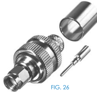
FIG. 26 RP-3000-I