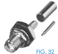
FIG. 32 RP-3252-1B1, RP-3252-1B

PHOTOS FOR REFERENCE ONLY, SHOWN AT 100% ACTUAL SIZE UNLESS OTHERWISE INDICATED.