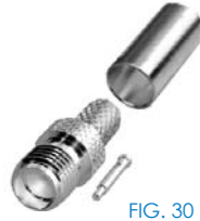
FIG. 30 RP-3050-1C, -1C1, 1C2