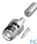
FIG. 29 RP-3050-1B, -1B1