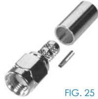
FIG. 25 RP-3000-1C, -1C1, 1X, -C, -C1, -C2 RPT-3000-1C, -C