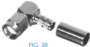
FIG. 28 RP-3010-1C, -1C1