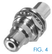
FIG. 4 RCA-1950-03

PHOTOS FOR REFERENCE ONLY, SHOWN AT 100% ACTUAL SIZE.