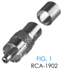
FIG. 1 RCA-1902