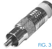
FIG. 3 RCA-1904-01-D, -02-D, -03-D