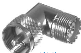
FIG. 10 RFU-532