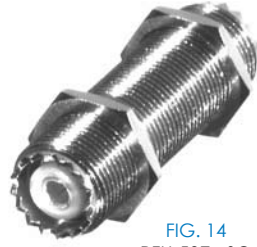
FIG. 14 RFU-537, -SO