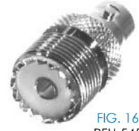
FIG. 16 RFU-545