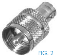
FIG. 2 RFB-1137