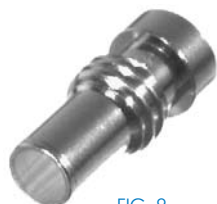
FIG. 9 RFU-530, -S, -531, -1, -S