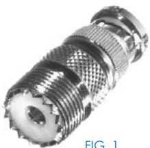
FIG. 1 RFB-1136

BODY: N - NICKEL S - SILVER PIN/CONTACT: G - GOLD S - SILVER DIELECTRIC: D - DELRIN DAP - DIALLYLPHTHALATE T - TEFLON