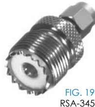
FIG. 19 RSA-3457