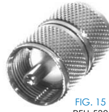
FIG. 15 RFU-538