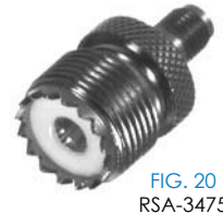
FIG. 20 RSA-3475