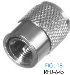
FIG. 18 RFU-645