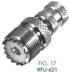
FIG. 17 RFU-621