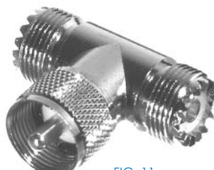
FIG. 11 RFU-533