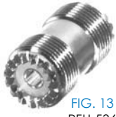
FIG. 13 RFU-536