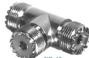
FIG. 12 RFU-534

PHOTOS FOR REFERENCE ONLY, SHOWN AT 100% ACTUAL SIZE.