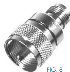
FIG. 8 RFT-1236