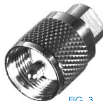
FIG. 3 RFE-6112