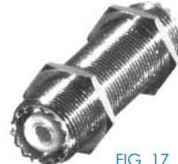
FIG. 17 RFU-537, -SO