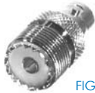
FIG. 19 RFU-545