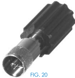
FIG. 20 RFU-551

PHOTOS FOR REFERENCE ONLY, SHOWN AT 75% ACTUAL SIZE.