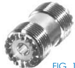
FIG. 16 RFU-536