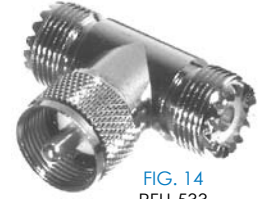
FIG. 14 RFU-533