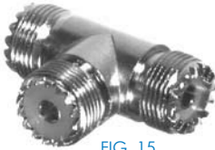
FIG. 15 RFU-534