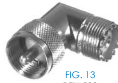
FIG. 13 RFU-532