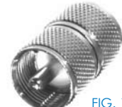
FIG. 18 RFU-538