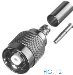
FIG. 12 RP-1202-C, -C1, -C2, -X