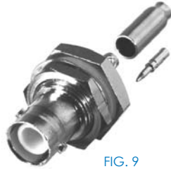
FIG. 9 RP-1117-BT