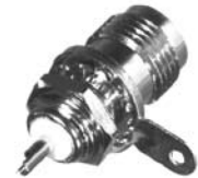
FIG. 15 RP-1211-1

PHOTOS FOR REFERENCE ONLY, SHOWN AT 100% ACTUAL SIZE UNLESS OTHERWISE INDICATED.