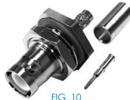
FIG. 10 RP-1117-C, -C1