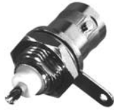
FIG. 8 RP-1116-NG