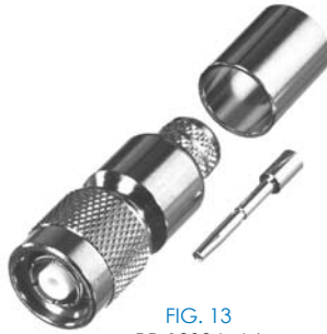
FIG. 13 RP-1202-I, -L6