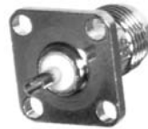
FIG. 14 RP-1210