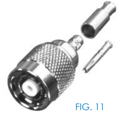
FIG. 11 RP-1202-1B, -1B1, -C3