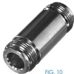
FIG. 10 RFN-1013-1-03