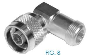
FIG. 8 RFN-1012-1 (shown at 75% size)