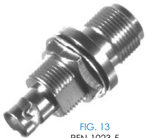
FIG. 13 RFN-1023-5