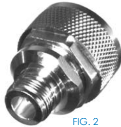
FIG. 2 RFD-1671-2 (shown at 75% size)