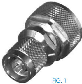
FIG. 1 RFD-1670-2 (shown at 75% size)

BODY: N - NICKEL S - SILVER SS - STAINLESS STEEL PIN/CONTACT: G - GOLD S - SILVER DIELECTRIC: T - TEFLON