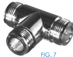
FIG. 7 RFN-1011-1 (shown at 75% size)