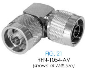
FIG. 21 RFN-1054-AV (shown at 75% size)