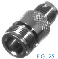
FIG. 25 RFT-1239