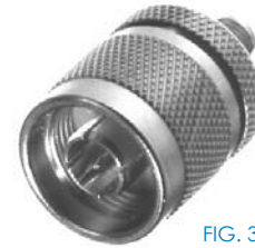
FIG. 33 RSA-3478