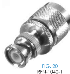
FIG. 20 RFN-1040-1