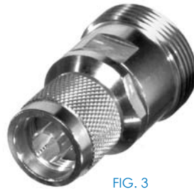
FIG. 3 RFD-1672-2 (shown at 75% size)