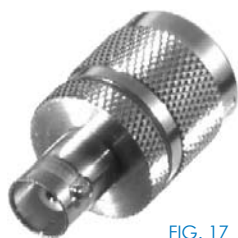
FIG. 17 RFN-1037-1