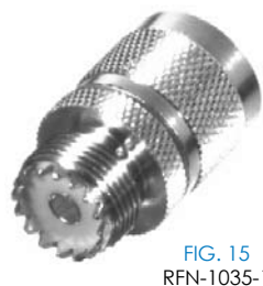
FIG. 15 RFN-1035-1