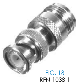
FIG. 18 RFN-1038-1