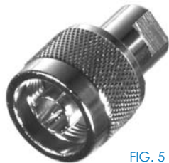
FIG. 5 RFE-6107