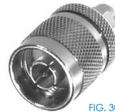
FIG. 30 RSA-3453