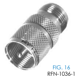
FIG. 16 RFN-1036-1