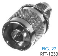
FIG. 22 RFT-1233