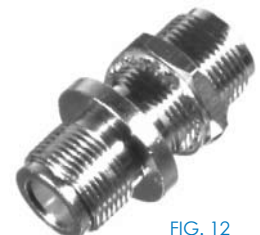
FIG. 12 RFN-1023

PHOTOS FOR REFERENCE ONLY, SHOWN AT 100% ACTUAL SIZE UNLESS OTHERWISE INDICATED.