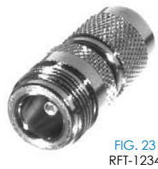
FIG. 23 RFT-1234