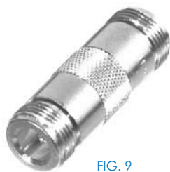
FIG. 9 RFN-1013-1