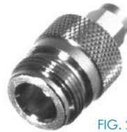
FIG. 29 RSA-3452