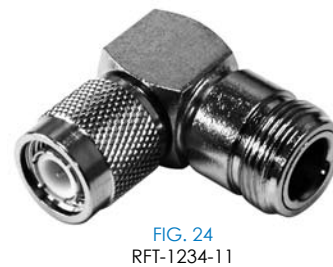
FIG. 24 RFT-1234-11

PHOTOS FOR REFERENCE ONLY, SHOWN AT 100% ACTUAL SIZE UNLESS OTHERWISE INDICATED.