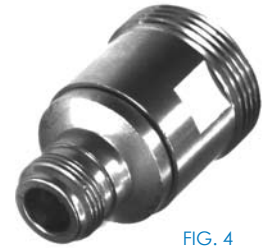
FIG. 4 RFD-1673-2 (shown at 75% size)