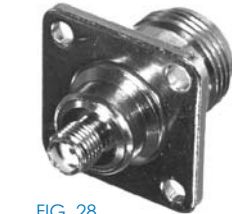
FIG. 28 RSA-3290, -10