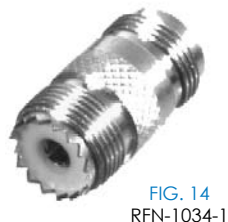
FIG. 14 RFN-1034-1