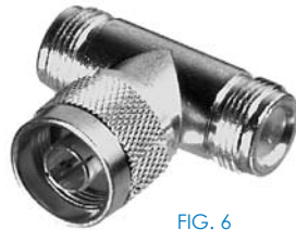
FIG. 6 RFN-1010-1 (shown at 75% size)