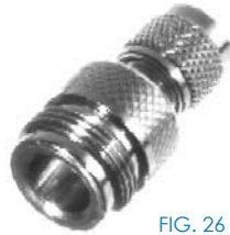
FIG. 26 RFU-620