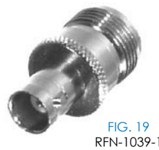
FIG. 19 RFN-1039-1