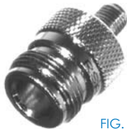
FIG. 31 RSA-3477, -2