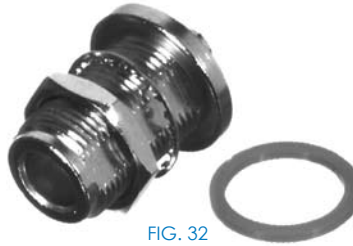
FIG. 32 RSA-3477-03