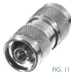
FIG. 11 RFN-1014-1