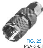
FIG. 25 RSA-3451