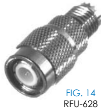
FIG. 14 RFU-628