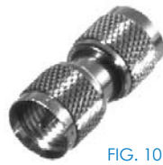
FIG. 10 RFU-624