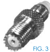
FIG. 3 RFE-6152