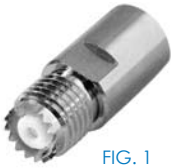
FIG. 1 RFE-6104

BODY: C - BLACK CHROME N - NICKEL PIN/CONTACT: G - GOLD S - SILVER T - TIN DIELECTRIC: D - DELRIN T - TEFLON