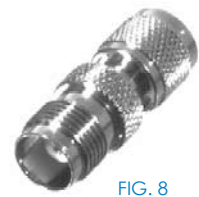
FIG. 8 RFU-623