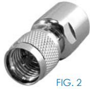
FIG. 2 RFE-6105