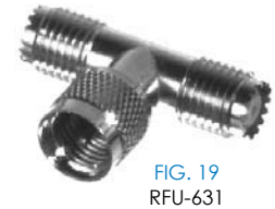
FIG. 19 RFU-631