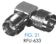
FIG. 21 RFU-633