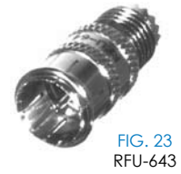
FIG. 23 RFU-643