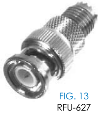
FIG. 13 RFU-627