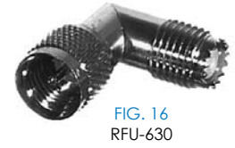
FIG. 16 RFU-630