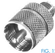
FIG. 12 RFU-626

PHOTOS FOR REFERENCE ONLY, SHOWN AT 100% ACTUAL SIZE.