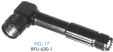
FIG. 17 RFU-630-1