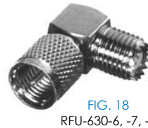
FIG. 18 RFU-630-6, -7, -8