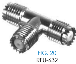
FIG. 20 RFU-632