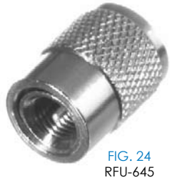
FIG. 24 RFU-645