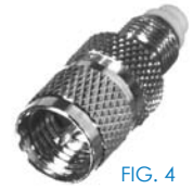
FIG. 4 RFE-6153