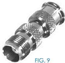
FIG. 9 RFU-623-5