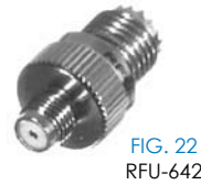
FIG. 22 RFU-642