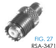
FIG. 27 RSA-3471