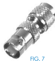
FIG. 7 RFU-622