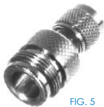
FIG. 5 RFU-620