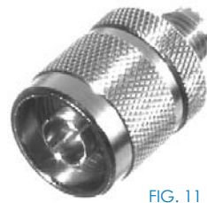
FIG. 11 RFU-625, -03