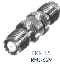
FIG. 15 RFU-629