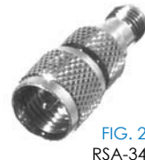
FIG. 26 RSA-3470