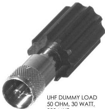
UHF DUMMY LOAD 50 OHM, 30 WATT, 300 MHz RFU-551