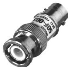
BNC ATTENUATOR 50 OHM, 1 WATT RFA-4050 (3 DB) RFA-4051 (6 DB) RFA-4052 (10 DB) RFA-4053 (20 DB)