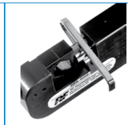
Lower die removal