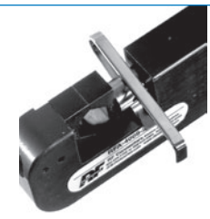
Lower die removal