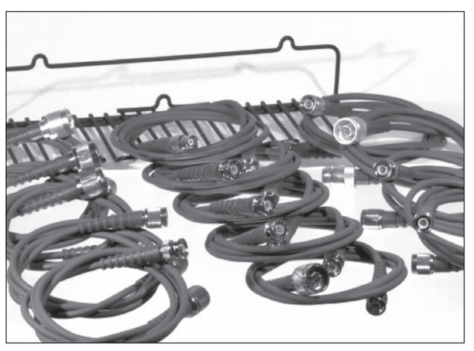
15-piece kit shown above. 7-piece kit also available. See chart for details.