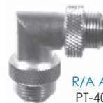
R/A Adapter PT-4000-026