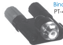
Binding Post PT-4010-020