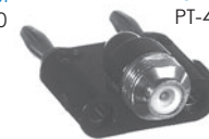
Banana Plug PT-4010-021