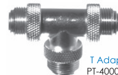
T Adapter PT-4000-027