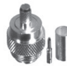
Male crimp PT-4010-030

PT-4010-062 — Mounting bulkhead connectors allows you to create or modify existing test fixtures ready for Unidapt™ use