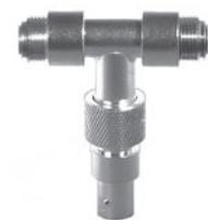
without end connectors RFA-4059-A1