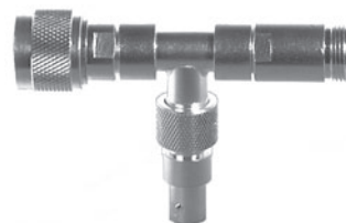
with N male (PT-4000-003) and N female (PT-4000-009) connectors (equiv. Motorola S8B80313B37) RFA-4059-A