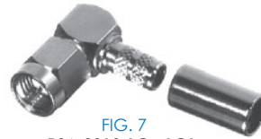
FIG. 7 RSA-3010-1C, -1C1, -7, -C, -C1, C2, -X