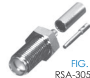
FIG. 8 RSA-3050-1B, -1B1, -B, -B1

PHOTOS FOR REFERENCE ONLY, SHOWN AT 100% ACTUAL SIZE.