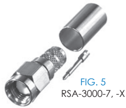
FIG. 5 RSA-3000-7, -X