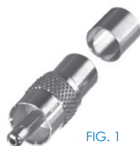
FIG. 1 RCA-1902