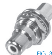
FIG. 3 RCA-1950-03

PHOTOS FOR REFERENCE ONLY, SHOWN AT 100% ACTUAL SIZE.