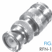
FIG. 65 RFN-1038-1