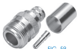
FIG. 59 RFN-1028-I2, -PL, -SI, SI2