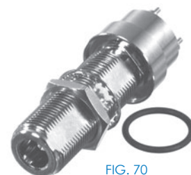
FIG. 70 RFS-2030

PHOTOS FOR REFERENCE ONLY, SHOWN AT 75% ACTUAL SIZE.