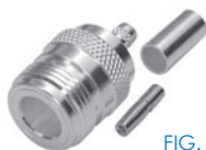
FIG. 60 RFN-1029-SP, -SX