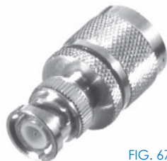
FIG. 67 RFN-1040-1