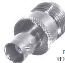
FIG. 66 RFN-1039-1