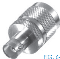
FIG. 64 RFN-1037-1