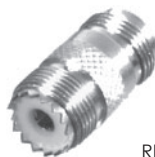
FIG. 61 RFN-1034-1