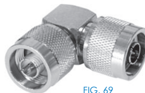
FIG. 69 RFN-1054-AV