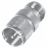
FIG. 63 RFN-1036-1