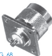
FIG. 68 RFN-1041-1