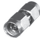
FIG. 3 RF35M-35M-00000, -G0000

PHOTOS FOR REFERENCE ONLY, SHOWN AT 150% ACTUAL SIZE.