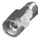
FIG. 2 RF35M-35F-00000