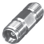
FIG. 1 RF35F-35F-00000