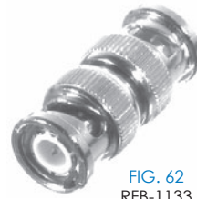
FIG. 62 RFB-1133