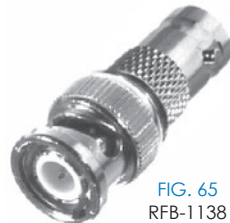
FIG. 65 RFB-1138