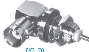
FIG. 70 RFB-1154