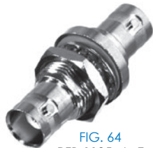
FIG. 64 RFB-1135, -I, -T