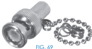
FIG. 69 RFB-1150-1, -2-1W