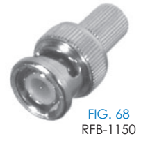
FIG. 68 RFB-1150