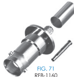
FIG. 71 RFB-1160