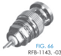
FIG. 66 RFB-1143, -03