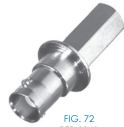
FIG. 72 RFB-1161

PHOTOS FOR REFERENCE ONLY, SHOWN AT 100% ACTUAL SIZE.