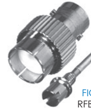
FIG. 67 RFB-1145