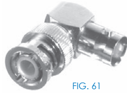
FIG. 61 RFB-1132