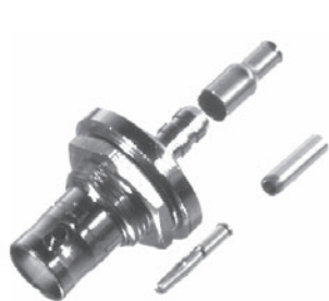
FIG. 50 RFB-1117-BT, -BT-03