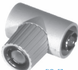
FIG. 57 RFB-1130-2