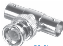
FIG. 56 RFB-1130, -1