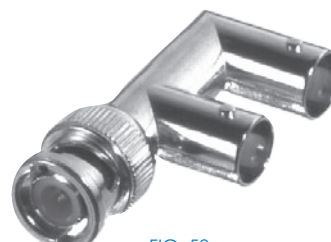
FIG. 58 RFB-1130-3