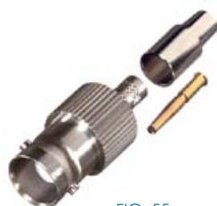
FIG. 55 RFB-1123-C3