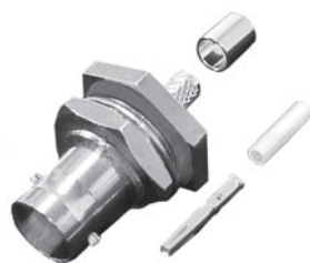
FIG. 51 RFB-1117-BT-04