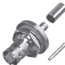
FIG. 52 RFB-1117-C1, C1T, -C2