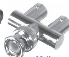
FIG. 59 RFB-1130-5

PHOTOS FOR REFERENCE ONLY, SHOWN AT 100% ACTUAL SIZE.