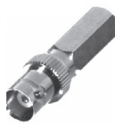
FIG. 53 RFB-1121