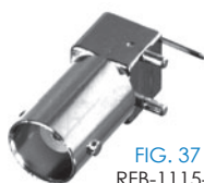
FIG. 37 RFB-1115-5