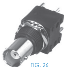
FIG. 26 RFB-1113-1B