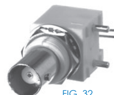
FIG. 32 RFB-1113-W