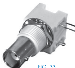
FIG. 33 RFB-1113-W-03