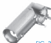
FIG. 38 RFB-1115-6