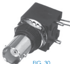
FIG. 30 RFB-1113-B