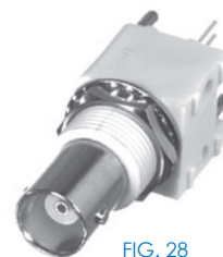
FIG. 28 RFB-1113-1W