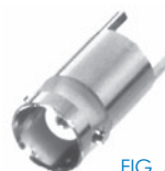
FIG. 35 RFB-1115-3