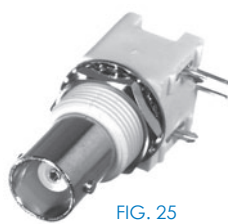
FIG. 25 RFB-1112-W-03