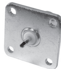
FIG. 39 RFB-1115-14

PHOTOS FOR REFERENCE ONLY, SHOWN AT 100% ACTUAL SIZE.