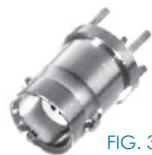
FIG. 36 RFB-1115-4