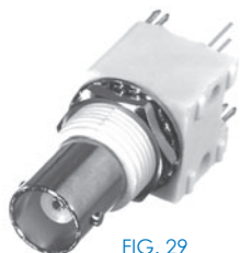
FIG. 29 RFB-1113-1W-03