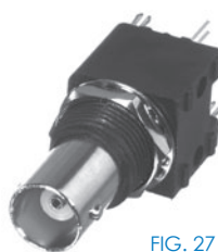
FIG. 27 RFB-1113-1B-03