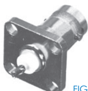
FIG. 34 RFB-1115