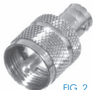
FIG. 2 RFB-1137