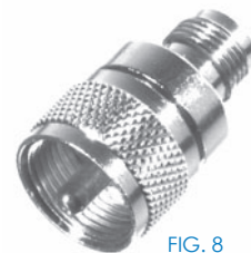
FIG. 8 RFT-1236