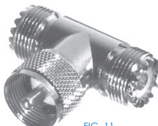
FIG. 11 RFU-533