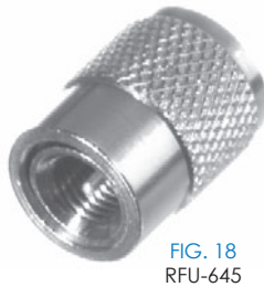
FIG. 18 RFU-645