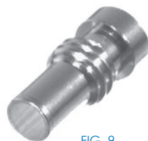
FIG. 9 RFU-530, -S, -531, -1, -S