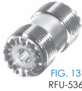
FIG. 13 RFU-536