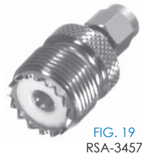
FIG. 19 RSA-3457