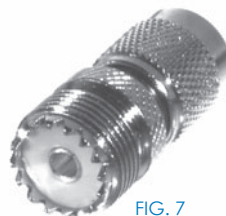
FIG. 7 RFT-1235