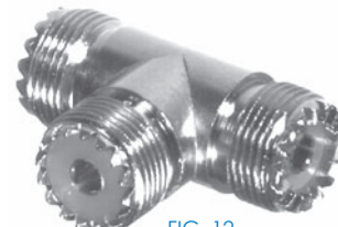
FIG. 12 RFU-534

PHOTOS FOR REFERENCE ONLY, SHOWN AT 100% ACTUAL SIZE.