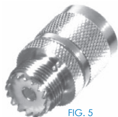
FIG. 5 RFN-1035-1