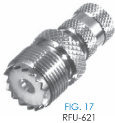
FIG. 17 RFU-621