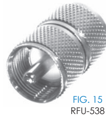
FIG. 15 RFU-538