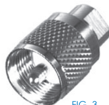
FIG. 3 RFE-6112