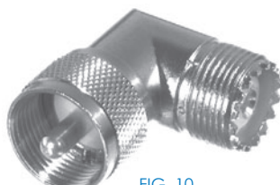
FIG. 10 RFU-532