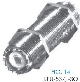
FIG. 14 RFU-537, -SO