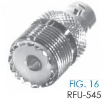
FIG. 16 RFU-545