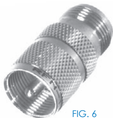
FIG. 6 RFN-1036-1