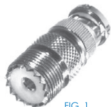
FIG. 1 RFB-1136

Body: N - Nickel S - Silver Pin/Contact: G - Gold S - Silver Dielectric: D - Delrin DAP - DiallylPhthalate T - PTFE