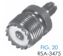
FIG. 20 RSA-3475

PHOTOS FOR REFERENCE ONLY, SHOWN AT 100% ACTUAL SIZE.