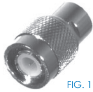
FIG. 1 RFE-6108

Body: C - Black Chrome N - Nickel Pin/Contact: G - Gold Dielectric: T - PTFE