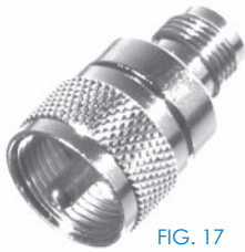
FIG. 17 RFT-1236