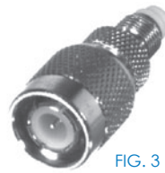
FIG. 3 RFE-6155