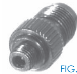
FIG. 27 RFT-1243