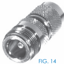
FIG. 14 RFT-1234