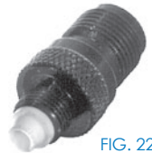
FIG. 22 RFT-1240-1