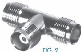
FIG. 9 RFT-1229