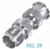
FIG. 29 RFU-623-5