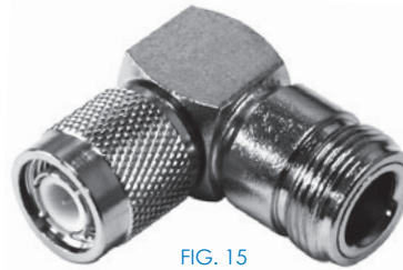
FIG. 15 RFT-1234-11