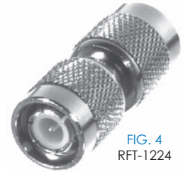
FIG. 4 RFT-1224