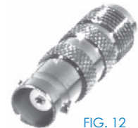
FIG. 12 RFT-1232