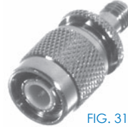
FIG. 31 RSA-3472