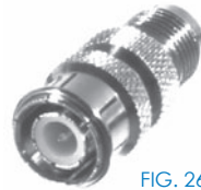
FIG. 26 RFT-1242