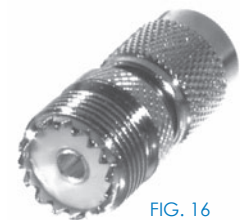
FIG. 16 RFT-1235

PHOTOS FOR REFERENCE ONLY, SHOWN AT 100% ACTUAL SIZE.