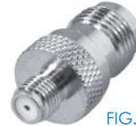
FIG. 23 RFT-1241-4