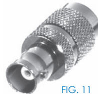
FIG. 11 RFT-1231