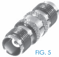
FIG. 5 RFT-1225