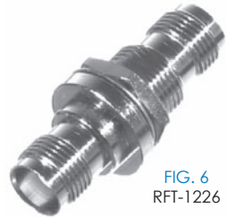
FIG. 6 RFT-1226