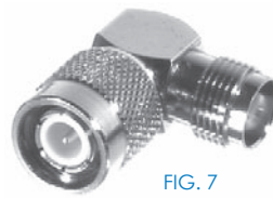
FIG. 7 RFT-1227