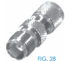
FIG. 28 RFU-623