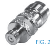
FIG. 24 RFT-1241-5