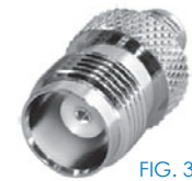
FIG. 32 RSA-3473

PHOTOS FOR REFERENCE ONLY, SHOWN AT 100% ACTUAL SIZE.