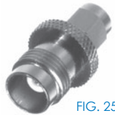
FIG. 25 RFT-1241-6