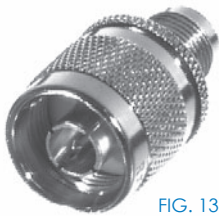
FIG. 13 RFT-1233