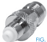
FIG. 21 RFT-1240