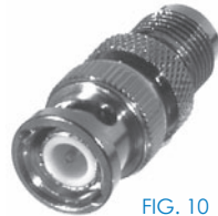
FIG. 10 RFT-1230