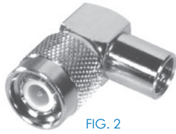
FIG. 2 RFE-6109