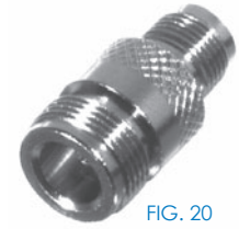
FIG. 20 RFT-1239