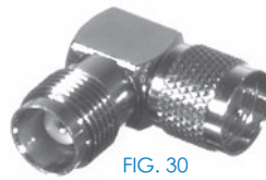
FIG. 30 RFU-633