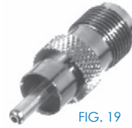
FIG. 19 RFT-1238