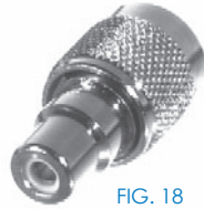
FIG. 18 RFT-1237