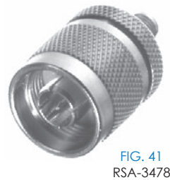
FIG. 41 RSA-3478