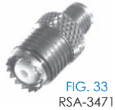
FIG. 33 RSA-3471