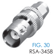
FIG. 30 RSA-3458