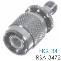
FIG. 34 RSA-3472