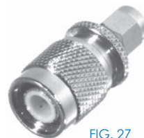
FIG. 27 RSA-3454