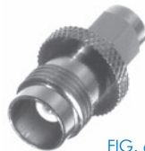
FIG. 6 RFT-1241-6