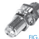
FIG. 20 RSA-3410, -1