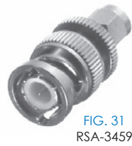
FIG. 31 RSA-3459