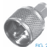
FIG. 28 RSA-3456

PHOTOS FOR REFERENCE ONLY, SHOWN AT 100% ACTUAL SIZE.