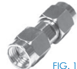
FIG. 12 RSA-3403, -1

PHOTOS FOR REFERENCE ONLY, SHOWN AT 100% ACTUAL SIZE.