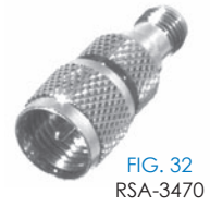
FIG. 32 RSA-3470