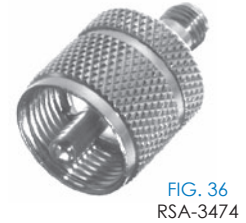
FIG. 36 RSA-3474