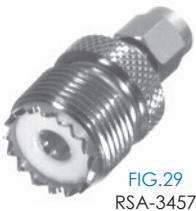
FIG. 29 RSA-3457