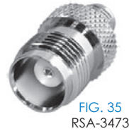
FIG. 35 RSA-3473