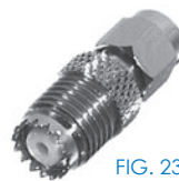
FIG. 23 RSA-3450