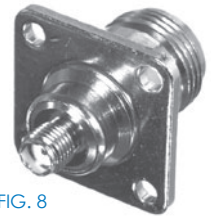
FIG. 8 RSA-3290, -10