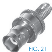
FIG. 21 RSA-3413