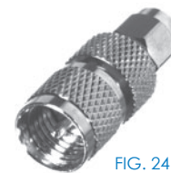
FIG. 24 RSA-3451