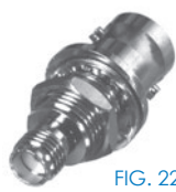
FIG. 22 RSA-3413-3