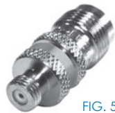
FIG. 5 RFT-1241-5