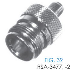
FIG. 39 RSA-3477, -2