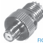
FIG. 7 RFU-642