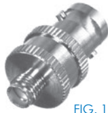
FIG. 1 RFB-1142, -4, -5, -6

Body: G - Gold N - Nickel S - Silver SS - Stainless Steel Pin/Contact: G - Gold Dielectric: T- PTFE