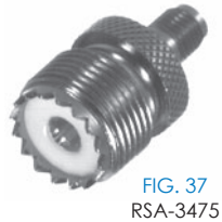
FIG. 37 RSA-3475