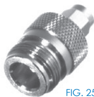
FIG. 25 RSA-3452