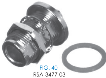
FIG. 40 RSA-3477-03