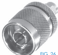
FIG. 26 RSA-3453