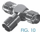
FIG. 10 RSA-3401