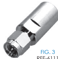
FIG. 3 RFE-6111