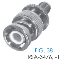
FIG. 38 RSA-3476, -1