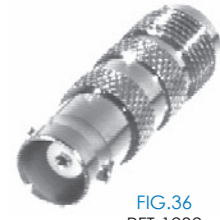
FIG. 36 RFT-1232