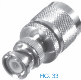
FIG. 33 RFN-1040-1