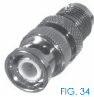
FIG. 34 RFT-1230