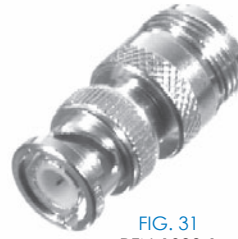
FIG. 31 RFN-1038-1