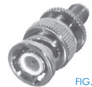
FIG. 44 RSA-3476, -1

PHOTOS FOR REFERENCE ONLY, SHOWN AT 100% ACTUAL SIZE.