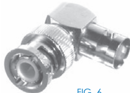
FIG. 6 RFB-1132