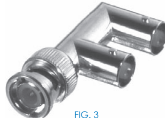
FIG. 3 RFB-1130-3