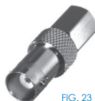
FIG. 23 RFE-6101