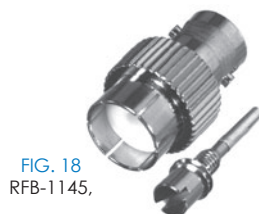
FIG. 18 RFB-1145,