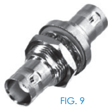
FIG. 9 RFB-1135, -I, -T