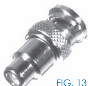
FIG. 13 RFB-1139