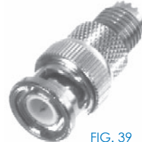
FIG. 39 RFU-627