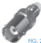
FIG. 26 RFE-6150