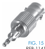
FIG. 15 RFB-1141