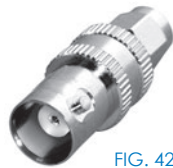
FIG. 42 RSA-3458