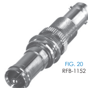
FIG. 20 RFB-1152