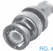
FIG. 43 RSA-3459