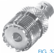
FIG. 37 RFU-545