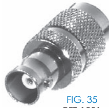
FIG. 35 RFT-1231