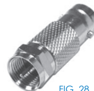
FIG. 28 RFF-1479

PHOTOS FOR REFERENCE ONLY, SHOWN AT 100% ACTUAL SIZE.