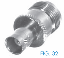
FIG. 32 RFN-1039-1