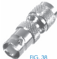
FIG. 38 RFU-622