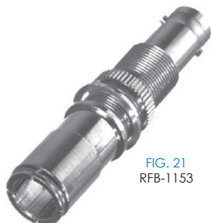
FIG. 21 RFB-1153