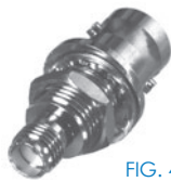
FIG. 41 RSA-3413-3