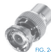
FIG. 24 RFE-6102