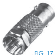
FIG. 17 RFB-1144