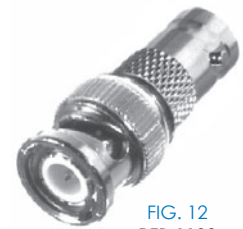
FIG. 12 RFB-1138

PHOTOS FOR REFERENCE ONLY, SHOWN AT 100% ACTUAL SIZE.