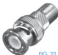
FIG. 22 RFB-1155