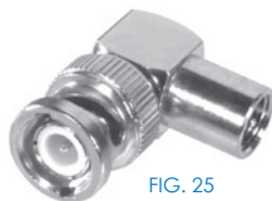
FIG. 25 RFE-6103