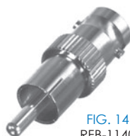
FIG. 14 RFB-1140