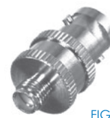
FIG. 16 RFB-1142, -4, -5, -6