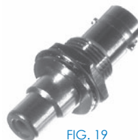
FIG. 19 RFB-1151