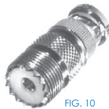
FIG. 10 RFB-1136