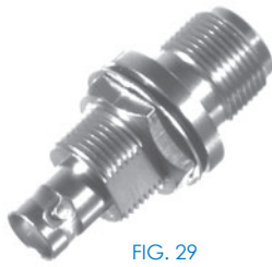
FIG. 29 RFN-1023-5