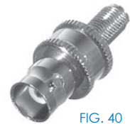
FIG. 40 RSA-3413