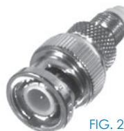
FIG. 27 RFE-6151