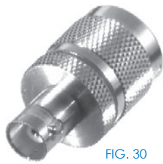
FIG. 30 RFN-1037-1