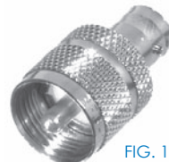
FIG. 11 RFB-1137