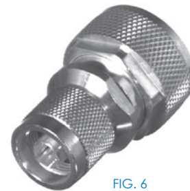
FIG. 6 RFD-1670-2