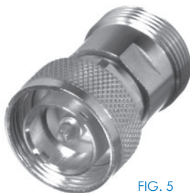
FIG. 5 RFD-1660-2