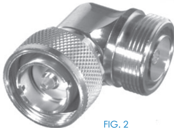
FIG. 2 RFD-1652-2