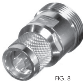
FIG. 8 RFD-1672-2