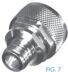
FIG. 7 RFD-1671-2