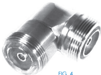
FIG. 4 RFD-1658-2