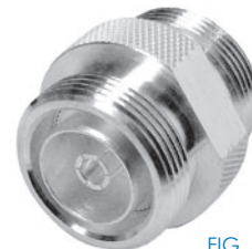
FIG. 3 RFD-1653-2