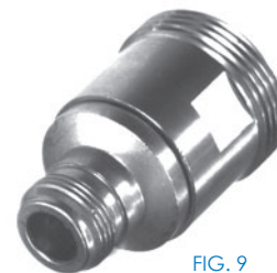
FIG. 9 RFD-1673-2

PHOTOS FOR REFERENCE ONLY, SHOWN AT 75% ACTUAL SIZE.